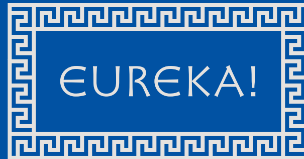
Greek Keys Stylistic Set 3 (.ss03)